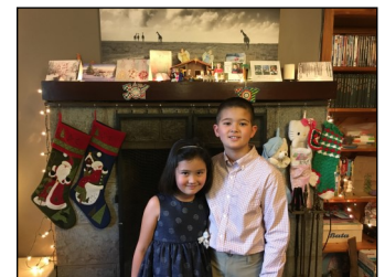
The Stockings are Hung!